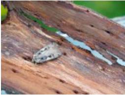
Large yellow underwing Noctua pronuba