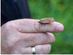
Micro moth, Agriphila inquinatella