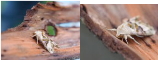
Angle Shades August Thorn

I had another opportunity to trap moths on the SFPT reserves on 12 th and 13 th August, this time at Orchid Glade. Conditions were near perfect. A dry night with a less than full moon and temperature overnight around 14°C. The only thing that could have improved prospects was some cloud cover. I was able to identify 15 species, 7 (maybe 8) of which were new to my SFPT (although they may have been reported by other recorders).